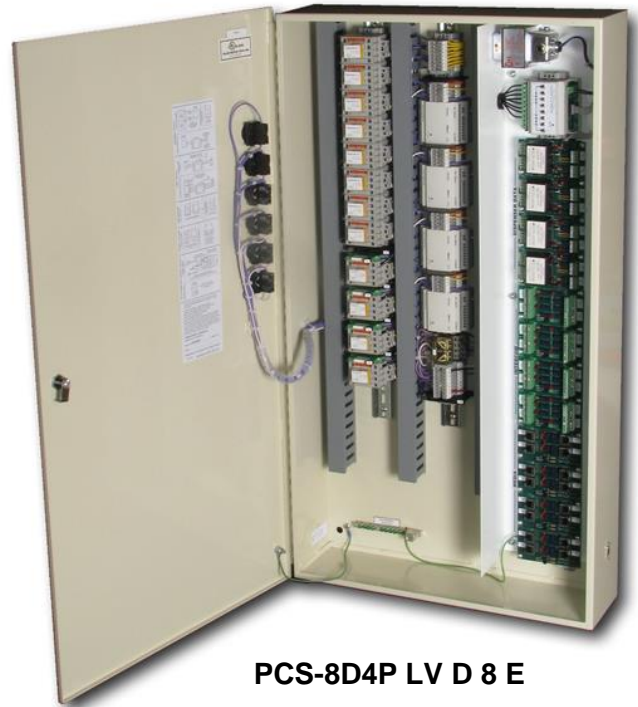
PCS-8D4P LV D 8 E

It provides the same high quality and performance benefits our customers have come to expect from Power Integrity.